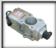
ATB T2 SERIES / CSA 45 to 65 mm Bore