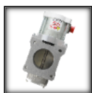
ATB T4 SERIES / CSA 75 mm to 95 mm Bore