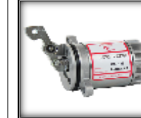
110 SERIES 12/24 V DC / Deutz 1011 & 2011 / 2, 3, and 4 cyl