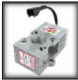
ATB T1 SERIES / CSA 25 to 40 mm Bore