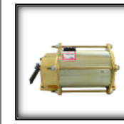
2001 SERIES ROTARY Engines from 400 - 1800 hp / 12.0 lb-ft Torque / <80 msec Response