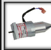
ALN SERIES LINEAR PUSH High Quality Antifriction Bearings / 22 mm Stroke