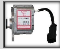
103 SERIES Mounts directly to Delphi DPG /DP210 pump