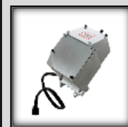
275 SERIES Bosch P3000, 7000, RP Style Fuel Injection Pump / Up to 12 cyl / Manual Shut-Off