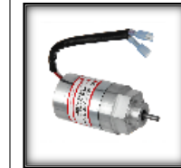
ALR SERIES LINEAR PULL Mounts Directly to Engine's Fuel Pump / Precision Linear Ball Bearings