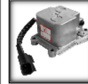
104 SERIES Briggs and Stratton / Kohler / 2 cyl V Style Engines