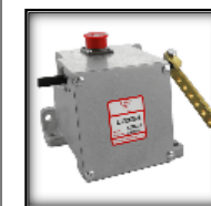
225 SERIES 2.2 lb-ft (3.0 N·m) / Net Torque / 25° Rotation / Multi-Plunger Fuel Pumps & Carburetors