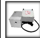
295 SERIES 24 V DC / Bosch P 9000 - 10,000 Pumps /Up to 16 cyl