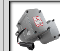
180 SERIES 12/24 V DC / Deutz 1012, 1013 & 2012 / Volvo 520/720 Engines