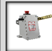
120 SERIES ROTARY Engines up to 150 hp / 1.0 lb-ft Torque / Small Inline Fuel Pumps or Carburetors