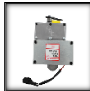
175 SERIES 12/24 V DC, Bosch P Pumps / Connects Directly to the Fuel Rack / Manual Shut-Off Mechanism