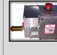
120E4 SERIES Integrated Metering Valve / Actuator Cummins PT Fuel System